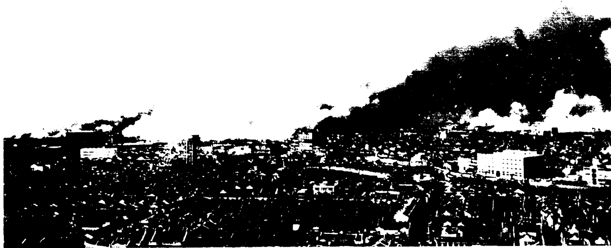
Support Element, 1st Strategic Air Command view of the north of Seoul, Korea, under bombardment by Chinese planes and artillery.